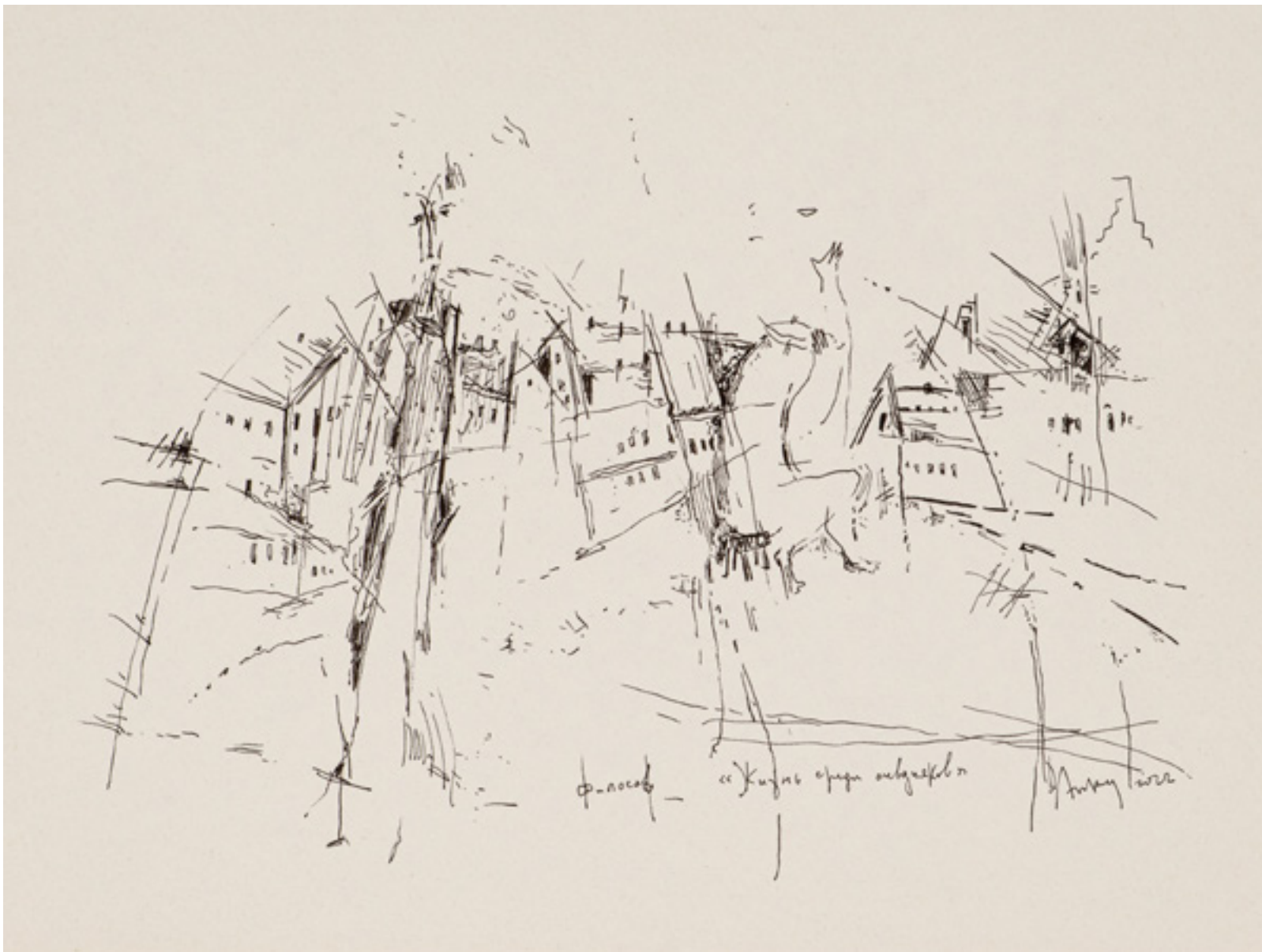
Philosopher. Life among draughts, 2022