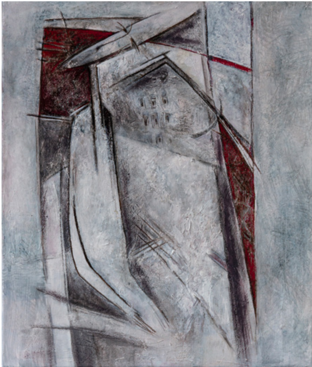
Two Souls, 2016 Mixed media, canvas 70x50