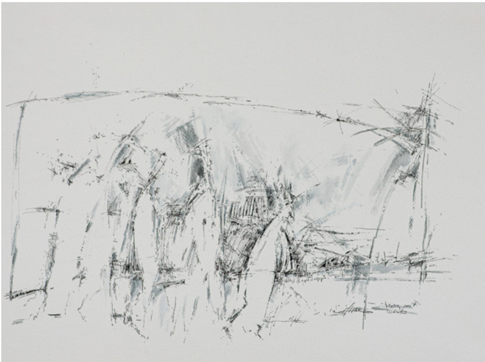
Procession, 2012 Watercolor, ink, paper 42x59,5