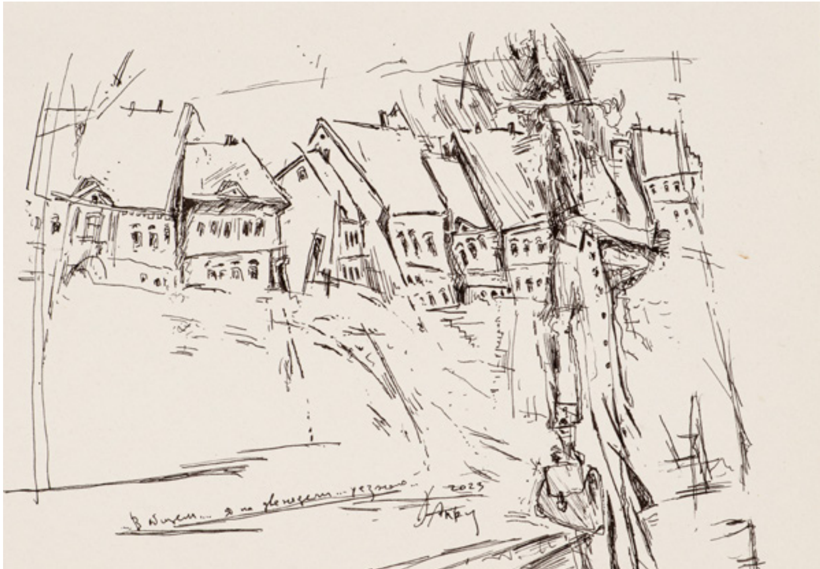
I'm going away for two weeks, 2023 Ink, paper 21x29.7