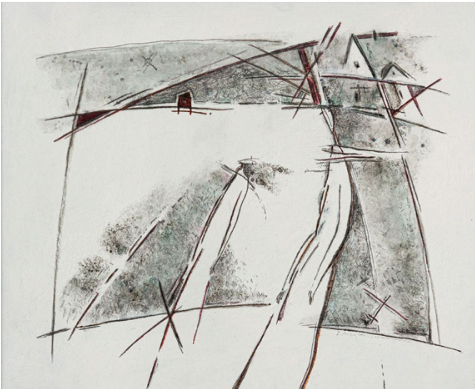
...from Unwritten, 2021 Watercolor, pencil, acrylic primer, varnish, organite 50x60