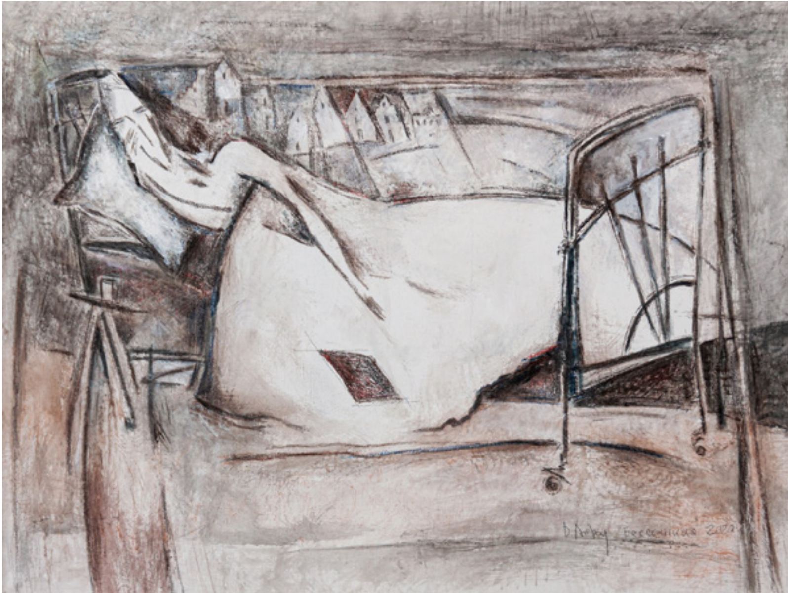
Insomnia, 2020 Mixed media, canvas 60x80