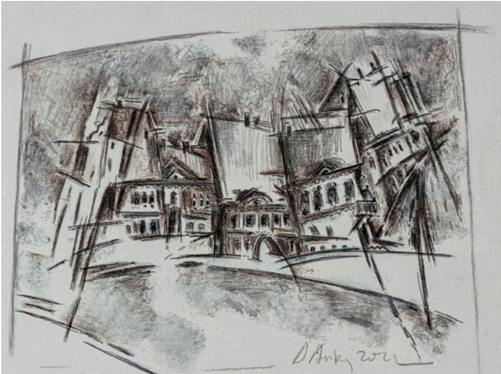
Dialogues with the Old City, 2021 Watercolor, ink, cardboard 35x50